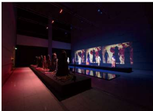
"Sayoko Yamaguchi" Museum of Contemporary Art Tokyo, Japan, 2015