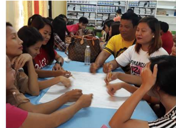
"Imagine" 2018, C, Roxas, Philippines