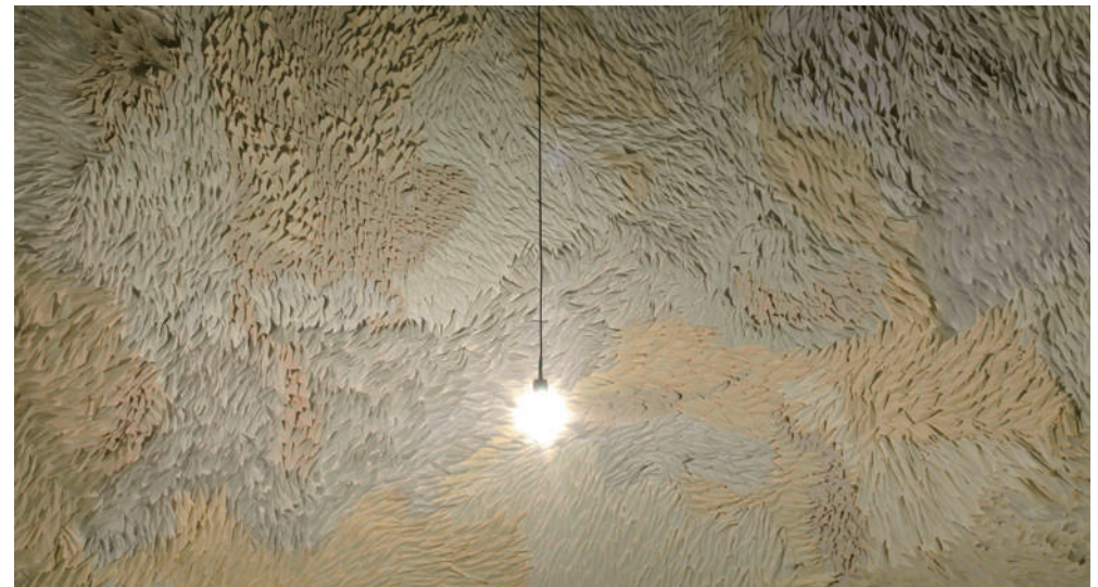
"SONG / animal in man, RHYTHM" Aomori Contemporary Art Center, 2013

For this installation Yamasaki checked and received nuances about the density of sounds: how sounds go around and flow in the space, and how muffled, crisp, or clear the sounds are. She attached numerous paper feathers covering the space to amplify or loosen up the sonorous features she caught, and those feathers function to resonate, reflect, or absorb the sounds. She vocalized and then attached feathers again and again, while communicating with the space to let it sing in a new way. This is how Yamasaki formed the installation.