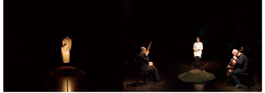
"Signs of Voices" Kyoto Art Center, Kyoto, Japan, 2017