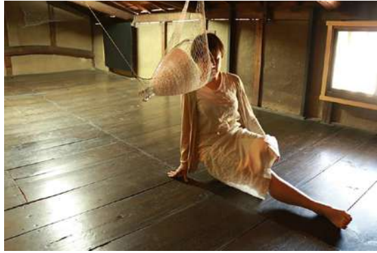
Ghost - Beyond the tangible - Zuiun-ann, Kyoto, Japan, 2016