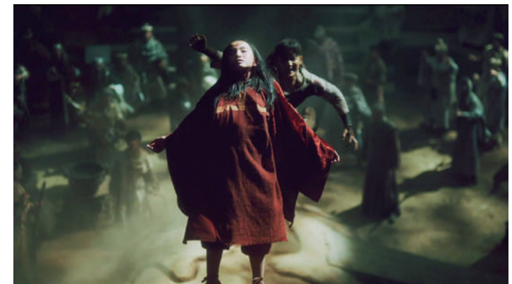
Narrator and voices for "MORIBITO II" TV drama, NHK, 2017