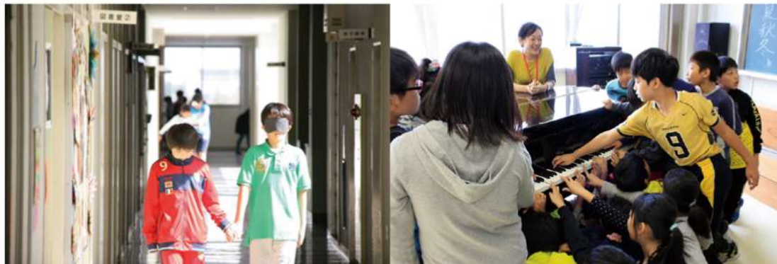
"Artist in School" 2016. 10/3 — 10/22 Sapporo Kojo Elementary, Hokkaido