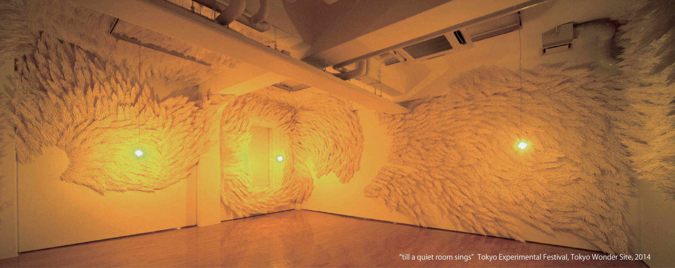
"till a quiet room sings" Tokyo Experimental Festival, Tokyo Wonder Site, 2014