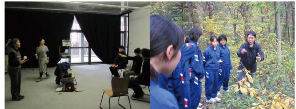
"To welcome the sound" 2013. 10.29 / 11.2 / 12.1 Aomori Contemporary Art Center, Aomori