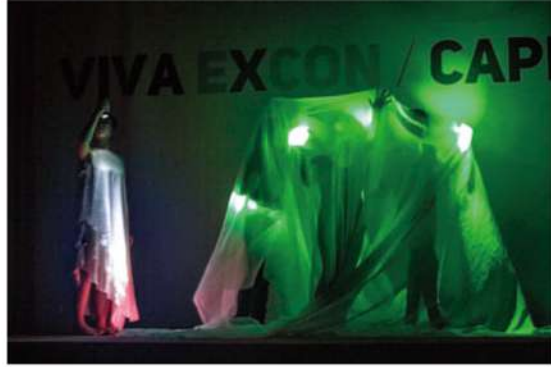
"Ephemeral Knots" VIVA EXCON 2018 CAPIZ, Philippines