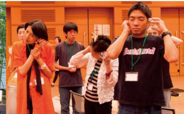
"Listen - to know by ears" 2015. 8/22, 23 National Museum of Art, Osaka