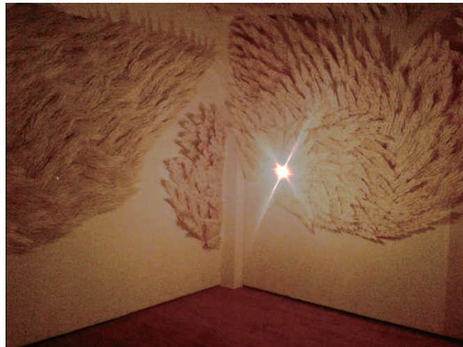
SONG / the animal in man, RHYTHM ACAC, Japan, 2013