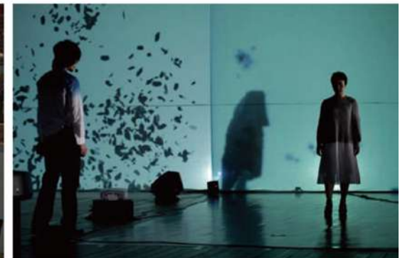
"Violence and Form Parade in Me" CIQ plaza, Kanagawa, Japan, 2013