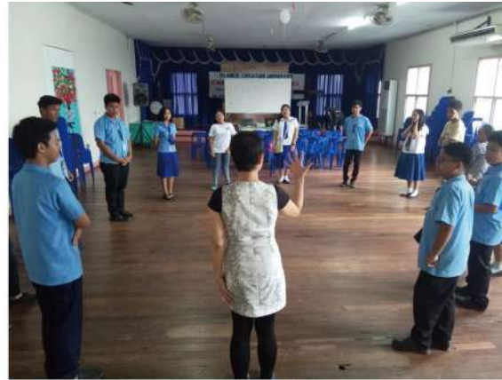
"Imagine" 2018, Filamer Universtiy, Roxas, Philippines