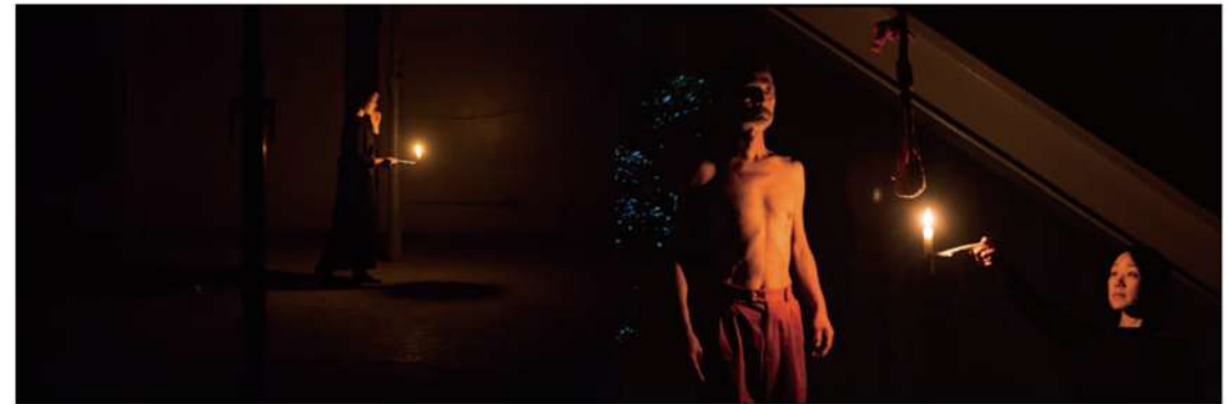
"Dream in Firelight" , Kanda Community Art Centre Organizing Committee, Site of Tokyo Denki University, Tokyo, Japan, 2015