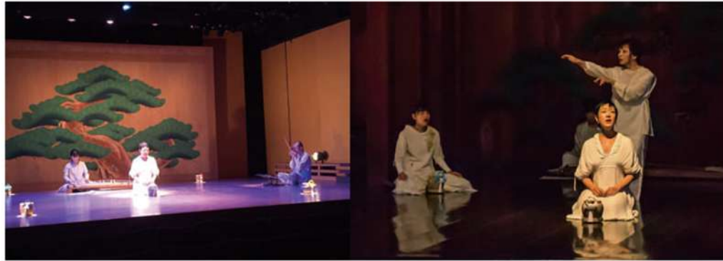
"Sounds to Summon the Japanese Gods" Japan Society, NYC, U.S, 2016/Sumiyoshi Shrine , Fukuoka, Japan, 2015