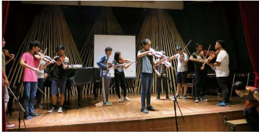
"World Listening Day" 2018, Casa San Miguel, Zambales, Philippines